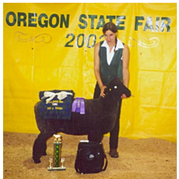
Below: the yearling ewe class at the National Jr. Show